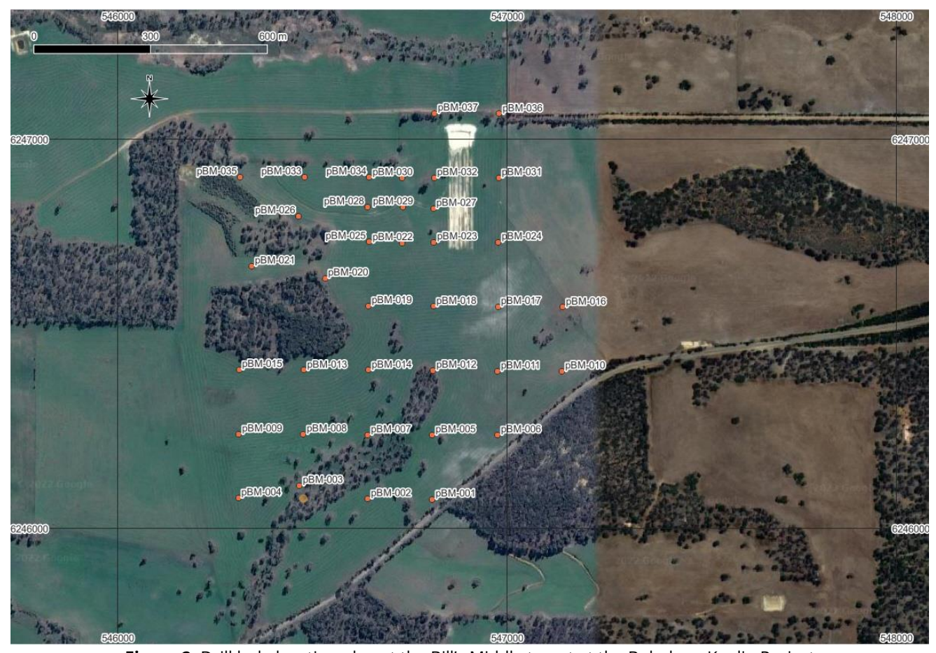
Figure 2: Drill hole location plan at the Bill's Middle target at the Bobalong Kaolin Project